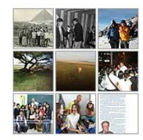
View more of my photos