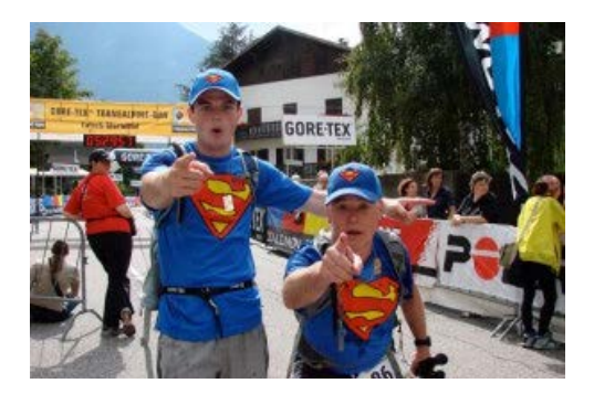
I'm talking to you!